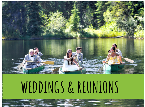
WEDDINGS & REUNIONS

FOR MORE INFORMATION AND TO BOOK: COLUMBIAOUTDOORSCHOOL.COM