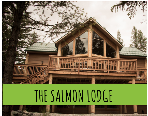
THE SALMON LODGE