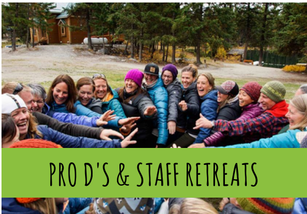
PRO D'S & STAFF RETREATS